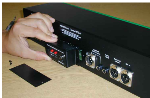
digital output installation

AES/EBU connection is also no difficulty as the output from the upgrade module is transformer balanced.